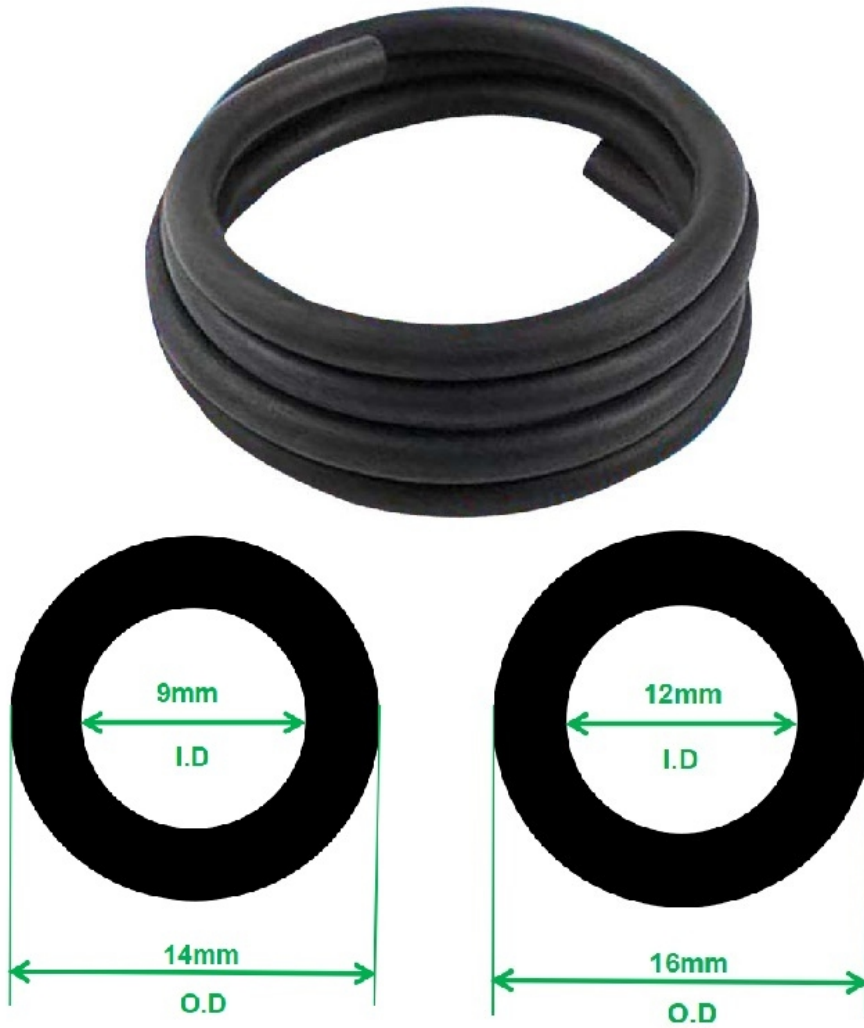
Reticulated Aeration Hose Size Description